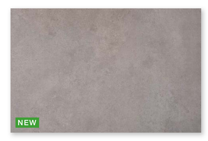
MATTE GREY DESIGNCLAD