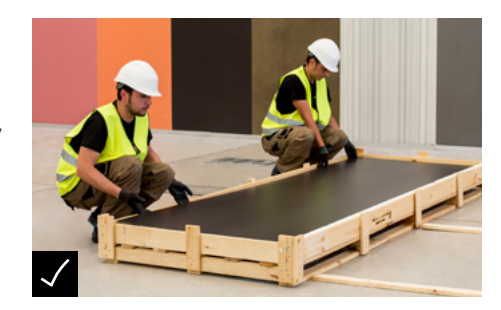
The 1500x1000mm DesignClad slabs must be removed from their box by two people situated in parallel.