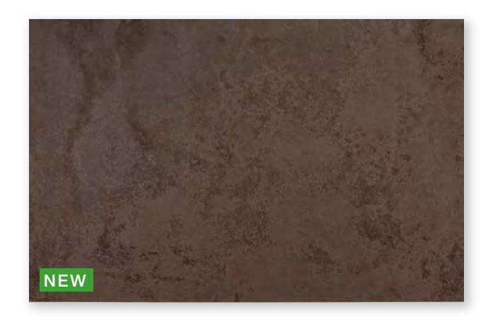
DARK MOCHA DESIGNCLAD

Premium DesignClad enables a sleek, contemporary finish at an affordable price. Available in eight attractive, stylish colours, this quality material is supplied in versatile 1800 x 900 x 9mm sheets.