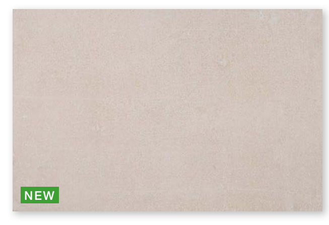
DESERT BEIGE DESIGNCLAD