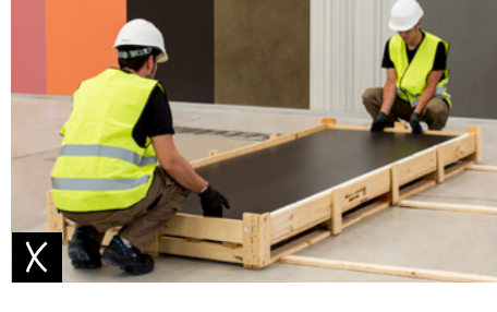
Do not position yourself opposite your workmate to remove the ceramic slabs from the box.