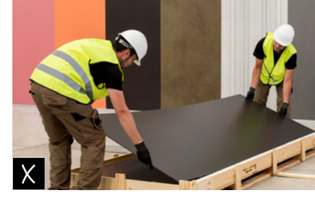
Do not remove the ceramic slab holding it by the corners.