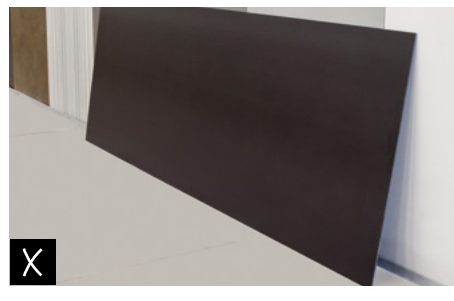
Do not rest the ceramic slab on any surface without protectors.