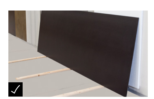
Position protectors when the ceramic slab is resting on any surface.