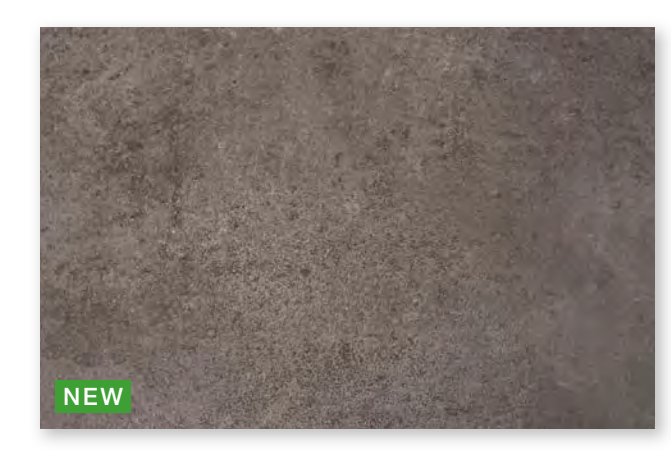
VINTAGE GREY DESIGNCLAD