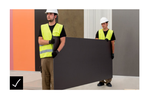
When the ceramic slab is in a vertical position lift it, keeping it always upright.