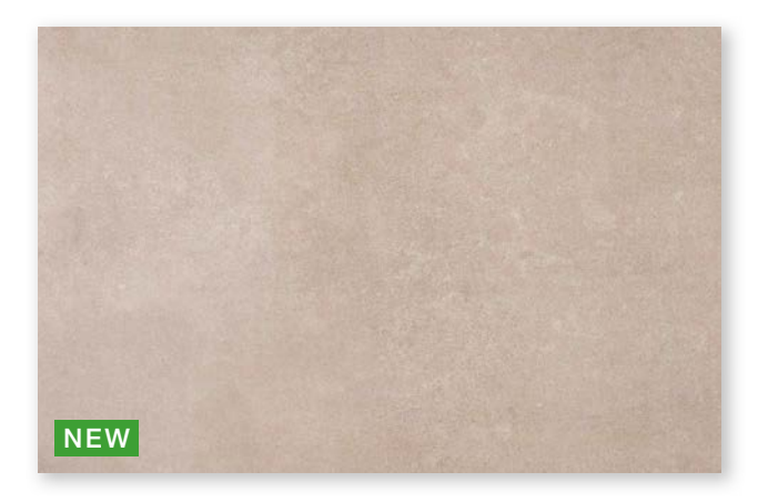
GOLDEN SAND DESIGNCLAD