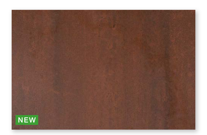
VINTAGE STEEL DESIGNCLAD