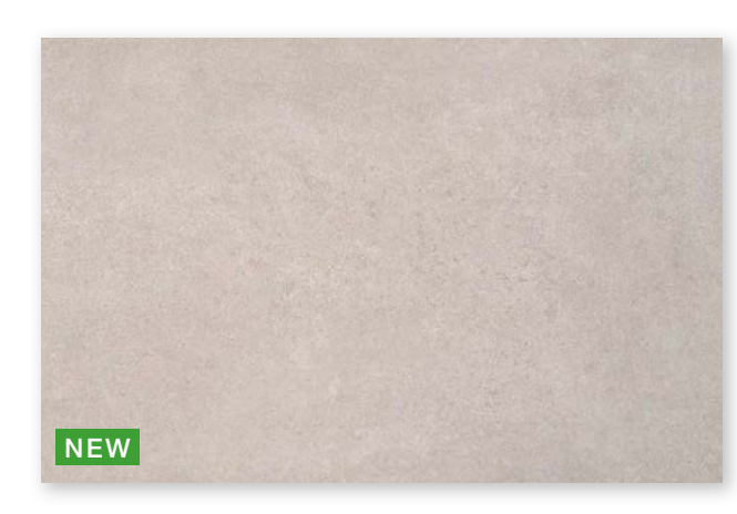
OFF WHITE DESIGNCLAD