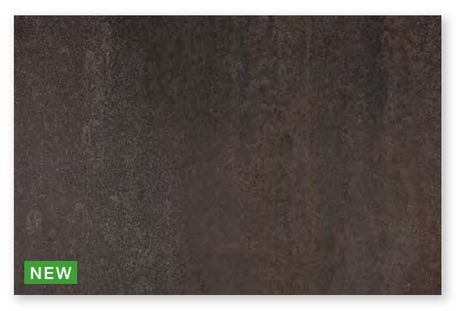
METAL DARK DESIGNCLAD