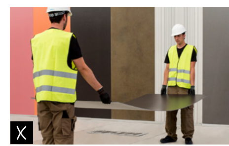
Do not hold or transport the ceramic slab in a horizontal position.