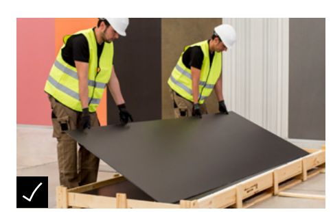
Hold the ceramic slab with both hands and raise it slowly. Do this at the same time as your workmate.