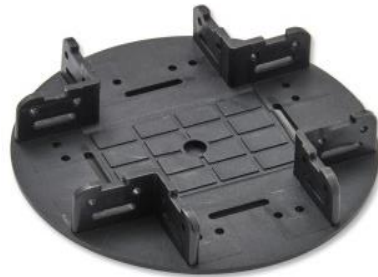
Self Levelling Joist Cradle

MESA Support pedestals are the most robust, intelligent and sustainable supports in the market. They can support loads of up to 1000 kg and come with a 20 year limited warranty. With adjustable heights ranging from 10 mm - 740 mm, they give you complete control of the height of the area