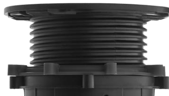
Extender Ring and Coupler