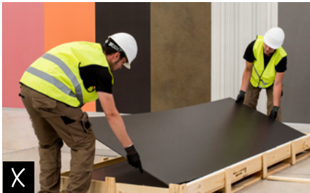
Do not remove the ceramic slab holding it by the corners.