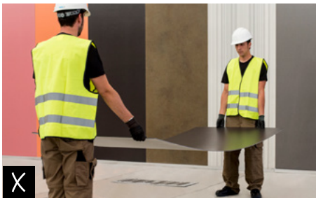
Do not hold or transport the ceramic slab in a horizontal position.