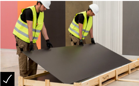
Hold the ceramic slab with both hands and raise it slowly. Do this at the same time as your workmate.