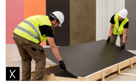
Do not remove the ceramic slab holding it by the corners.