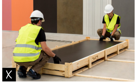
Do not position yourself opposite your workmate to remove the ceramic slabs from the box.