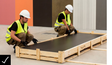
The 1500x1000mm DesignClad slabs must be removed from their box by two people situated in parallel.