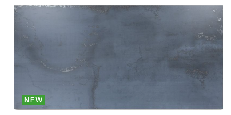
SIENNA BLUE DESIGNCLAD