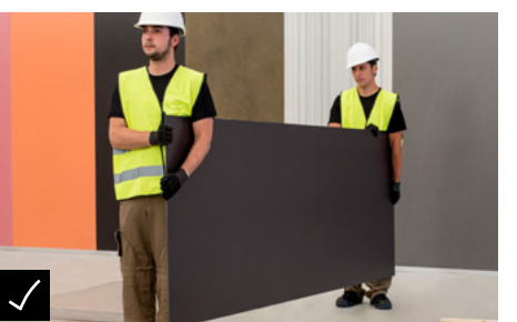
When the ceramic slab is in a vertical position lift it, keeping it always upright.