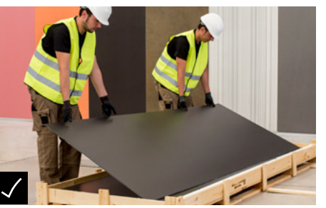
Hold the ceramic slab with both hands and raise it slowly. Do this at the same time as your workmate.