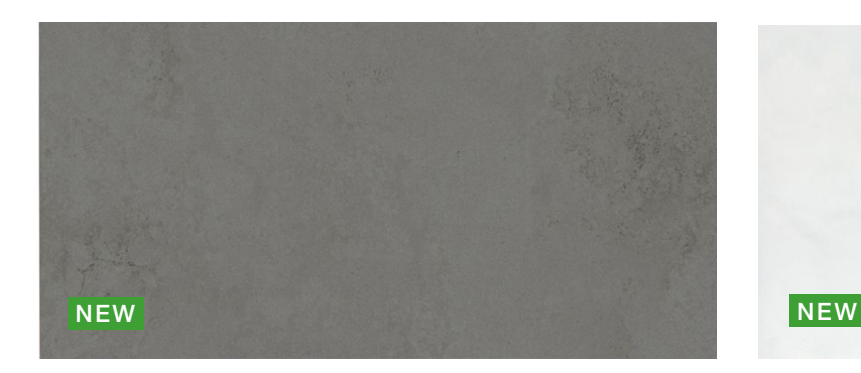
VALENCIA GREY DESIGNCLAD