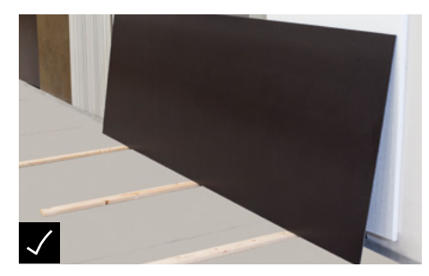
Position protectors when the ceramic slab is resting on any surface.