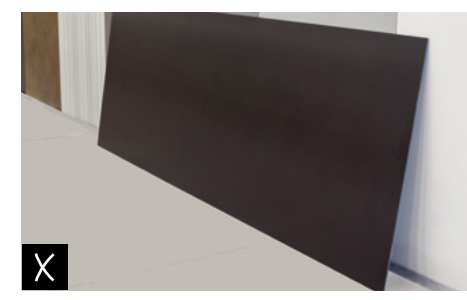
Do not rest the ceramic slab on any surface without protectors.

DesignClad is a high specification product. Precise cutting is required to achieve the optimum finish. For complete accuracy use the London Stone in-house cutting service. If you do intend to cut this material on site, we recommend following these guidelines: