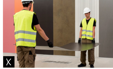
Do not hold or transport the ceramic slab in a horizontal position.