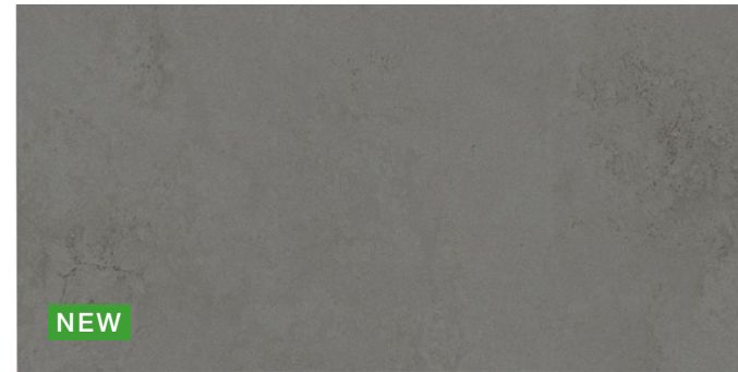
VALENCIA GREY DESIGNCLAD