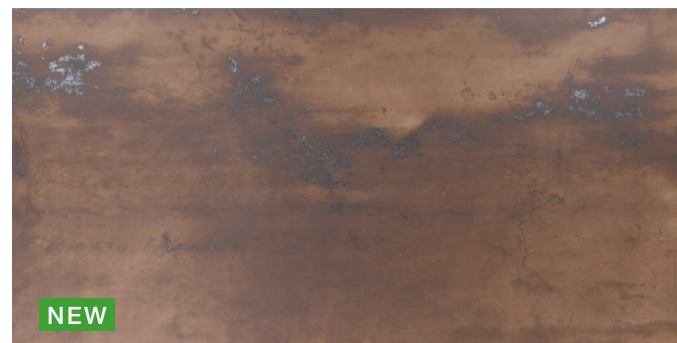
SIENNA COPPER DESIGNCLAD