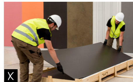
✗ Do not remove the ceramic slab holding it by the corners.