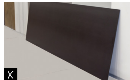
✗ Do not rest the ceramic slab on any surface without protectors.