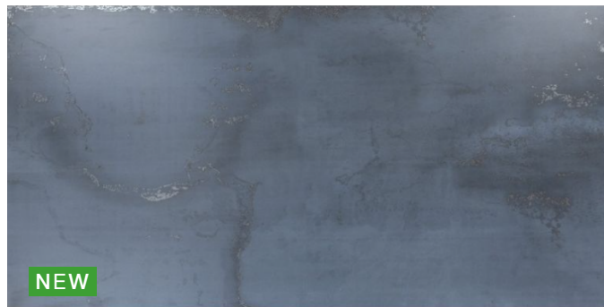
SIENNA BLUE DESIGNCLAD