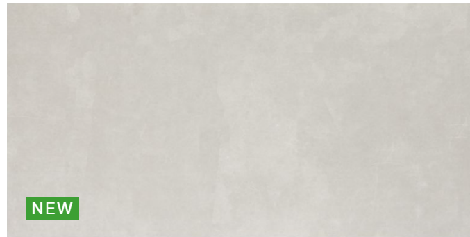
ALMERIA BEIGE DESIGNCLAD