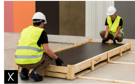
✗ Do not position yourself opposite your workmate to remove the ceramic slabs from the box.