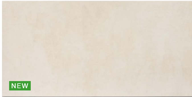
ALMERIA ASH DESIGNCLAD

Compact DesignClad enables a sleek, contemporary finish at an affordable price. Available in eight attractive, stylish colours, this quality material is supplied in versatile 1200 x 600 x 9mm sheets.