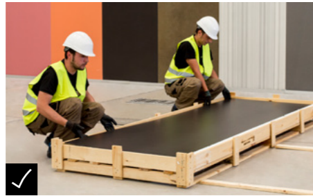
✓ The 1500x1000mm DesignClad slabs must be removed from their box by two people situated in parallel.