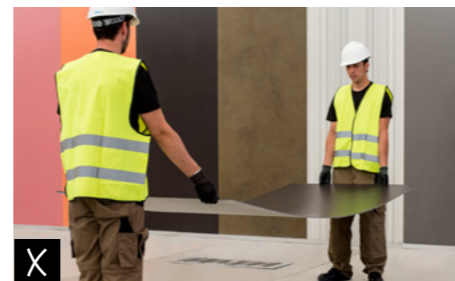
✗ Do not hold or transport the ceramic slab in a horizontal position.