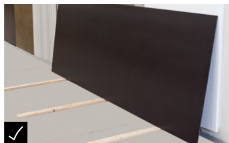
✓ Position protectors when the ceramic slab is resting on any surface.