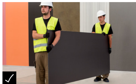
✓ When the ceramic slab is in a vertical position lift it, keeping it always upright.