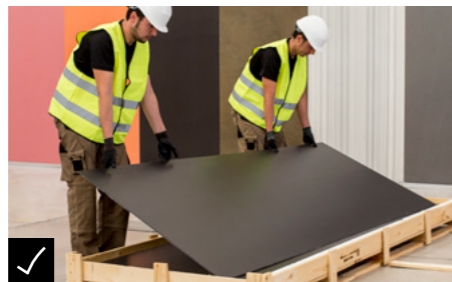
✓ Hold the ceramic slab with both hands and raise it slowly. Do this at the same time as your workmate.