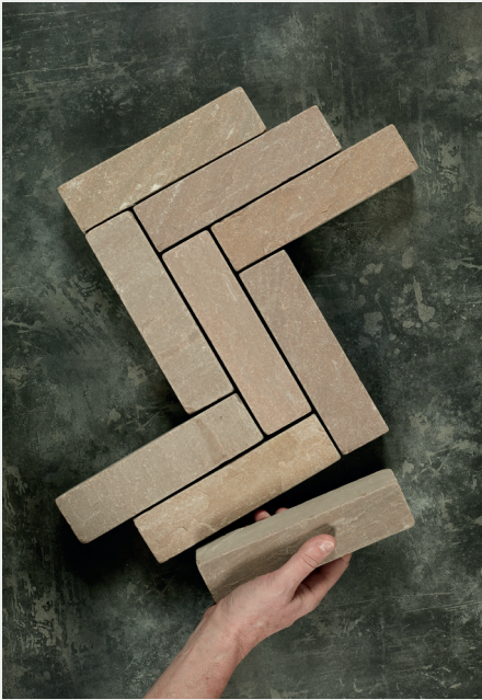
Raj Green Sandstone

Paving size L 200 x W 50 x H 40mm Pack size 9m 2 / 900 pcs Pack weight 975 kg