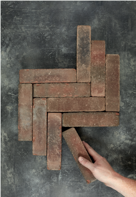
Abbey Dark Multi

Paving size L 200 x W 48 x D 58mm Pack size 10.61 m 2 / 1040 pcs Pack weight 1,352 kg