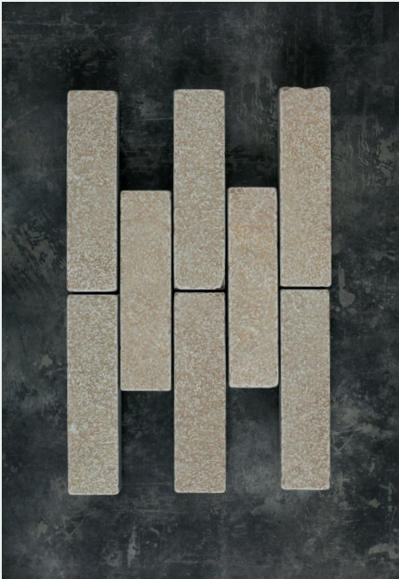
Antique Yellow Limestone

Paving size L 200 x W 50 x H 40mm Pack size 9m 2 / 900 pcs Pack weight 877.50 kg