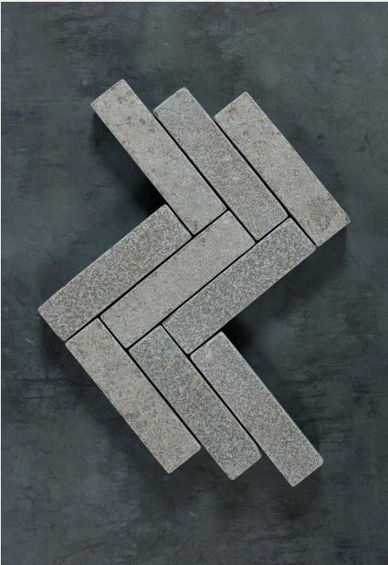
Antique Grey Limestone

Paving size L 200 x W 50 x H 40mm Pack size 9m 2 / 900 pcs Pack weight 975 kg