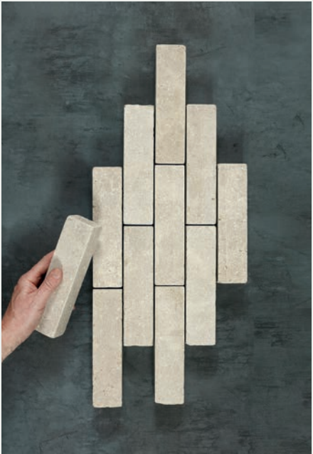
Antique Egyptian Limestone

Paving size L 200 x W 50 x H 40mm Pack size 9m 2 / 900 pcs Pack weight 975 kg