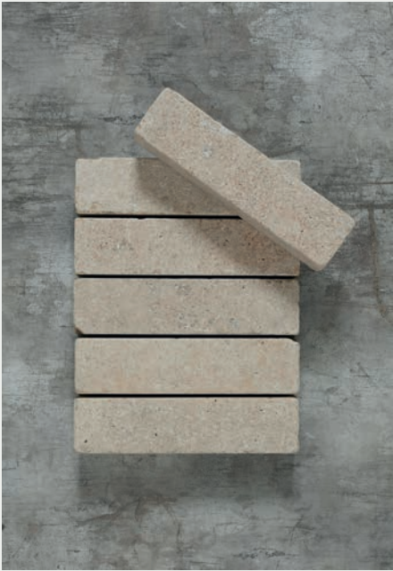
Egyptian Beige Limestone

Paving size L 200 x W 50 x H 40mm Pack size 9m 2 / 900 pcs Pack weight 877.50 kg